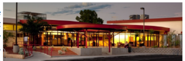
The Ott Family YMCA in Tucson, Arizona